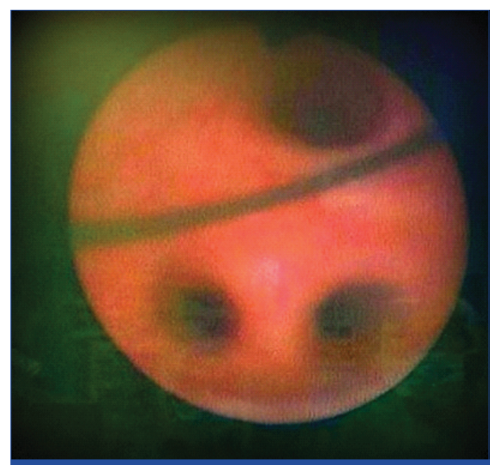
[Table/Fig-2]: Right ureteroscopy-luminal openings of right triple ureters seen orming a single lower ureter